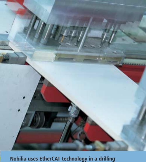
Nobilia uses EtherCAT technology in a drilling system for small and narrow components, and in a front drilling line as part of a drawer production line.